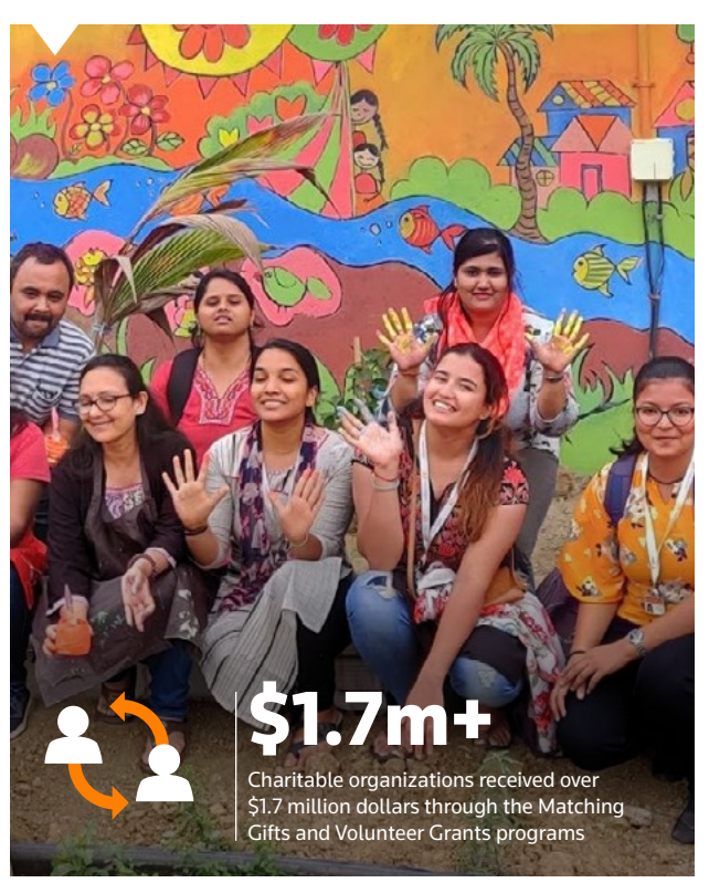
Employees in Vadodara, India working with a local children's shelter.

Employees engaged in Hour Power programs spending an hour with office colleagues to make a difference in the lives of others and participated in our Community Champion program having their group volunteer efforts rewarded with charitable grants. We matched employees donations via our Matching Gifts program and rewarded their volunteer efforts through our Volunteer Grants program.