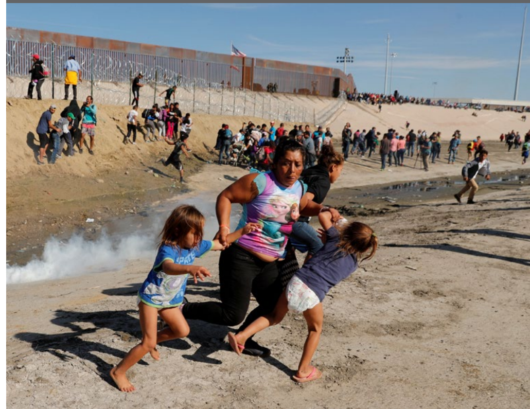
A migrant family, part of a caravan of thousands traveling from Central America to the United States, run away from tear gas in front of the border wall between the U.S. and Mexico in Tijuana, Mexico, November 25, 2018

The Trustees are aware that in order to fulfil their responsibilities, including those arising out of potential expansion into new areas of business and the evolving nature of the news media industry, they need to be kept informed of key developments through contact with the board and senior management of Thomson Reuters. They are encouraged to visit offices around the world and meet Thomson Reuters management and staff. Reports of these visits are sent to the other Trustees and also to senior management of Thomson Reuters. Procedures exist to ensure they are rapidly alerted to any perceived external or internal threat to the integrity or independence of Thomson Reuters which might benefit from their intervention or require them to exercise their power.